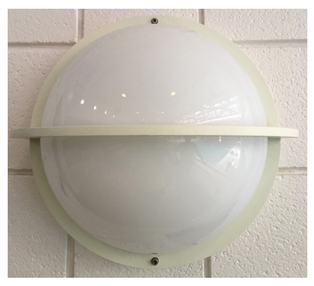
ActiveLED Bega Retrofit

Applications include: Commercial offices, hospitals, libraries, municipalities, universities and colleges